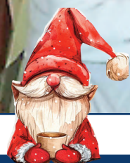
Sleipner Lodge Seterskveld had a good turnout & everyone had a great time!