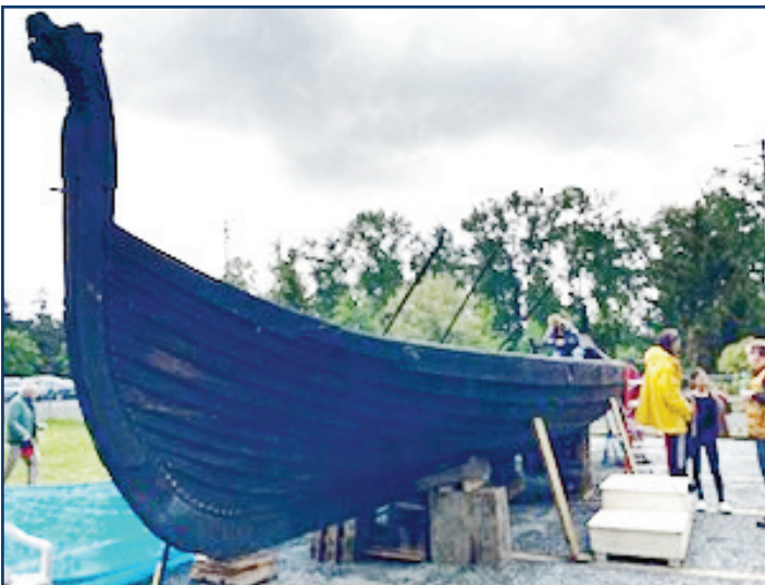
Left: The Munin Viking Ship in the process of being restored