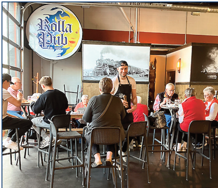
Dawson Creek members enjoying our September dinner night out at the Post & Row. The old Rolla Pub sign is a salvage icon from the old place in Rolla. Just a little history.